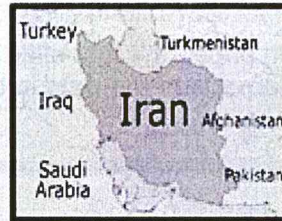
Fig. 1. Map of Iran. "Iran." CultureGrams World Edition. 2010. Web. 18 Oct. 2010.

Persia was the "historic region of southwestern Asia associated with the area that is now modern Iran" ("Persia").